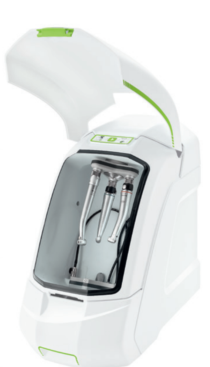
Assistina 3x3 3 instruments x 3 preparation steps: Internal cleaning, external cleaning, lubrication