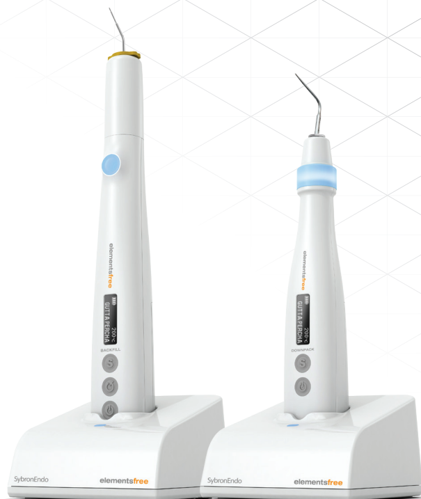
Single Charging Base