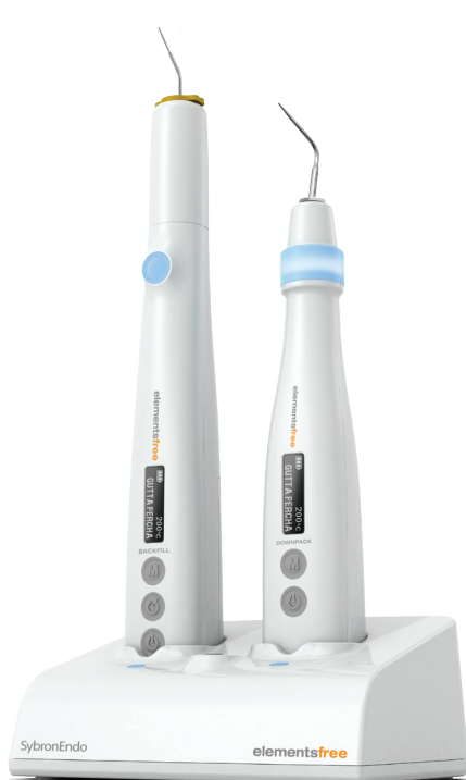
Dual Charging Base

n., Powered obturation with no strings attached